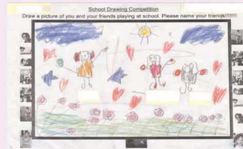
A pupil's drawing. All the names have been covered to preserve anonymity

Through this school-based inquiry research project we were able to promote pupil voice activities and help the school take forward its action research. The work highlighted for us how powerful and meaningful it can be to get children's views on issues relating to the practices and policy-making that directly affect them. We discovered that inclusive education is really possible if all education stakeholders are willing to collaborate.